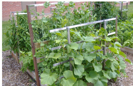
Square foot intensive method of gardening.

Culture and Knowledge Sharing: We will also include cultural sharing between gardeners through the summer to better understand our neighbors.