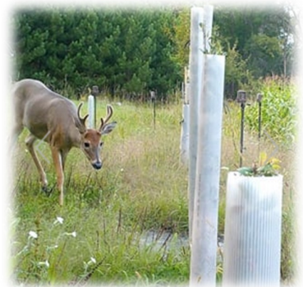
4-foot Tree Shelters

The tree shelter we sell ships flat, pops up to a generous, leaf expanding 3.9 inch diameter and installs quickly and easily with large tie holes for different staking options. The 4-foot tubes are vented to allow superior air exchange for efficient CO2 replenishment and to assure proper dormancy (hardening off) before winter. Tree shelters are available any time throughout the year at the Wood County Land & Water Conservation Department. Tree shelters are $4.03 + tax (includes 3 zip ties and a net cover). PLEASE NOTE: stakes are NOT included.