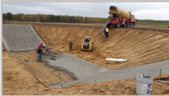
Concrete being poured into a constructed manure storage pit.