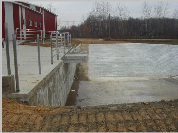
Manure storage pit after construction.